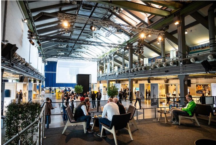
(5) A trade show atmosphere also prevailed in the Old Welding Shop.