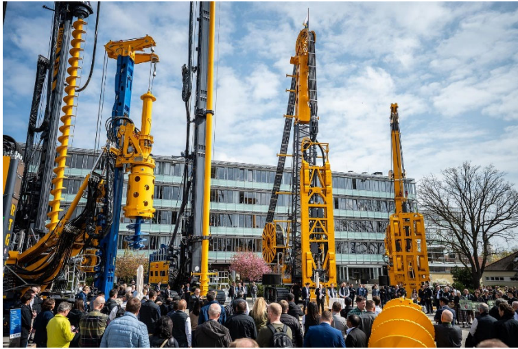
(2) Over 1,400 guests accepted the invitation from the BAUER Maschinen Group.