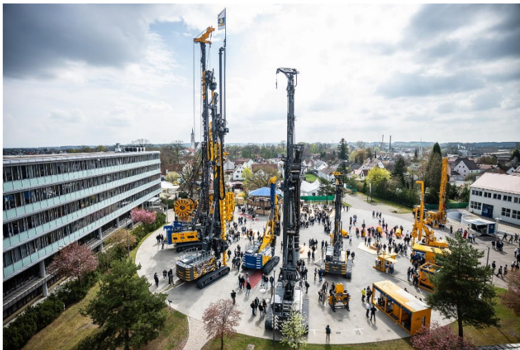
(3) From diaphragm wall to pile driving and drilling technology: Bauer presented a wide range of machines.