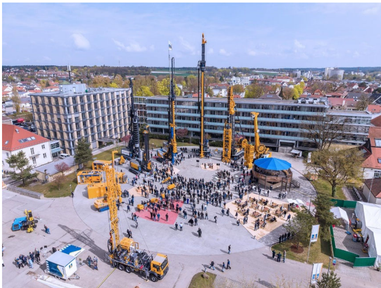
(1) BAUER Maschinen GmbH's In-House Exhibition took place from April 16 to 18 in Schrobenhausen, Germany.