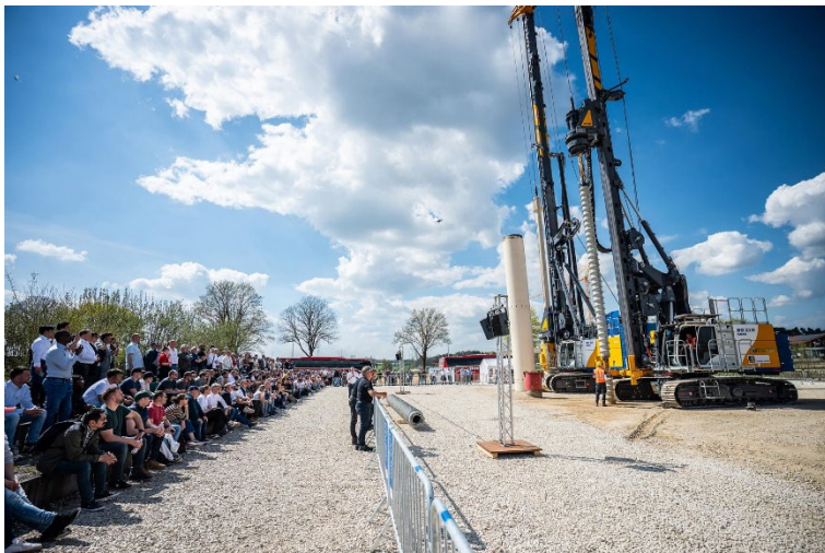
(6) Live demonstrations on the nearby plant grounds in Aresing, factory tours, and expert panel discussions were also on the agenda.